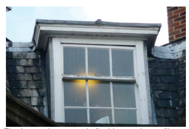
Fig. 3 note deep gaps in flashing on the roofline

with no obvious gaps or weak areas to allow mammal access. Gaps between the brickwork and the roof, had been coated with sealant and were in a good state of repair.