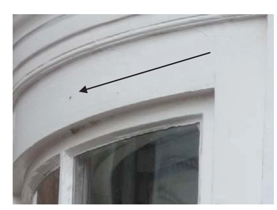
Fig. 2 The arrow marks position of a dropping on the window of the Principals office. Flashing pins above this window were often missing.

There were regular points where lead flashing was no longer flush to the tiles or window framework, either through lost pins or where they had been subject to past repairs. The vents were open and not covered by chicken wire and could theoretically allow mammal access. There were no collections of bat droppings splayed on the walls or urine stains on the windows (windows were not routinely cleaned, useful for survey purposes).