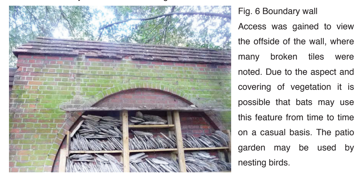
Access was gained to view the offside of the wall, where many broken tiles were noted. Due to the aspect and covering of vegetation it is possible that bats may use this feature from time to time

Two noteworthy areas are the wall and the patio garden, both are found along the southern boundary with Worcester college.