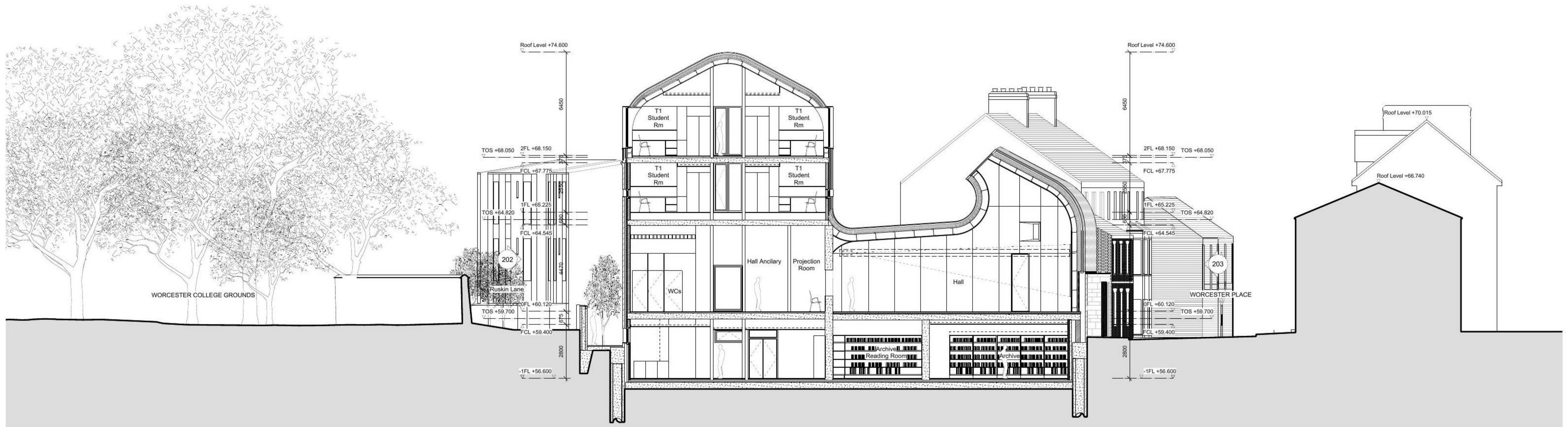
9 CROSS SECTION 9