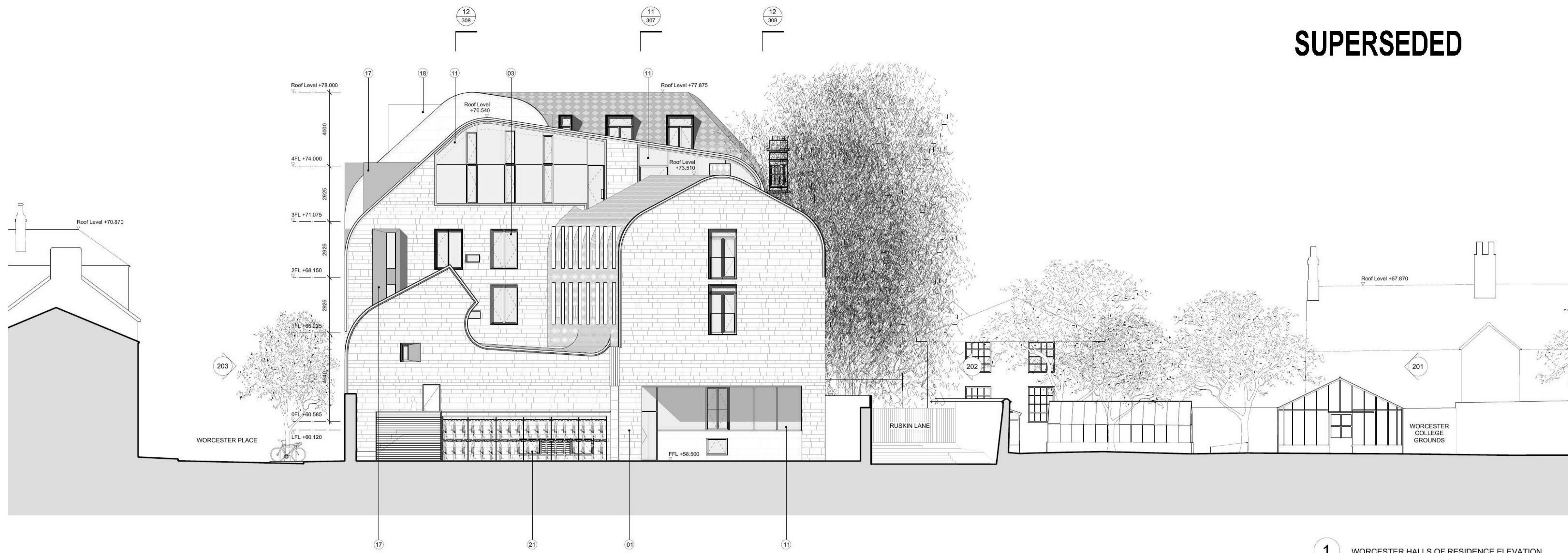
1 WORCESTER HALLS OF RESIDENCE ELEVATION