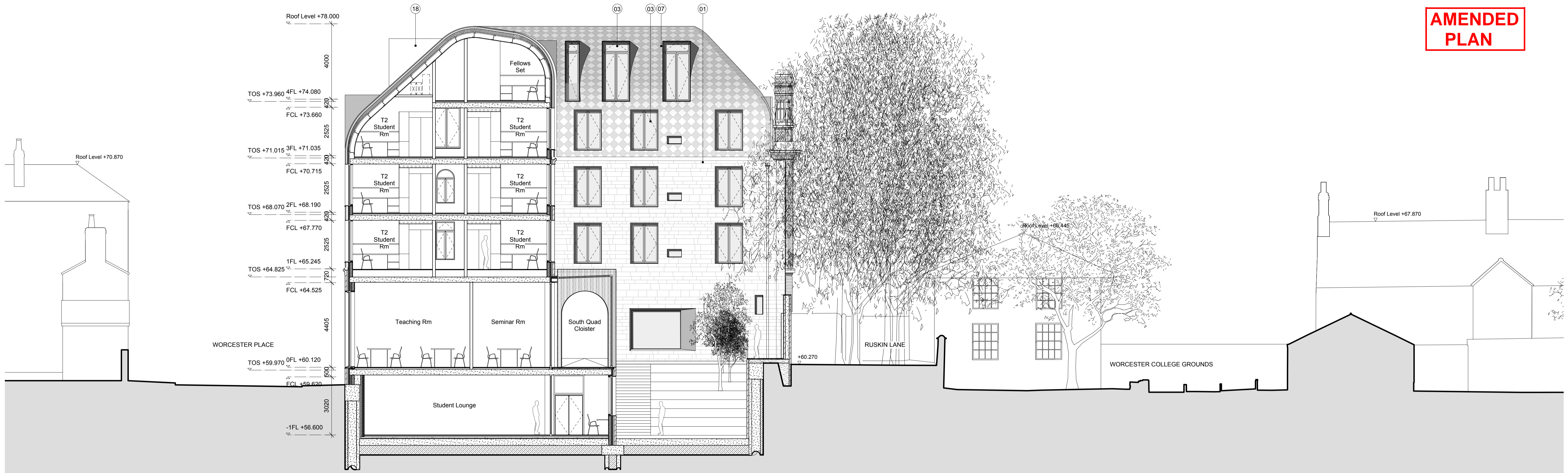
3 CROSS SECTION 3