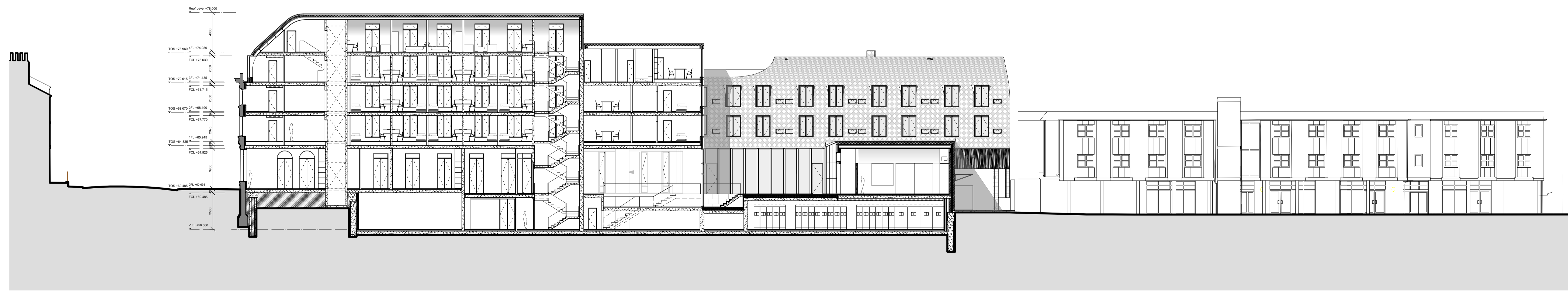
10 LONG SECTION 10