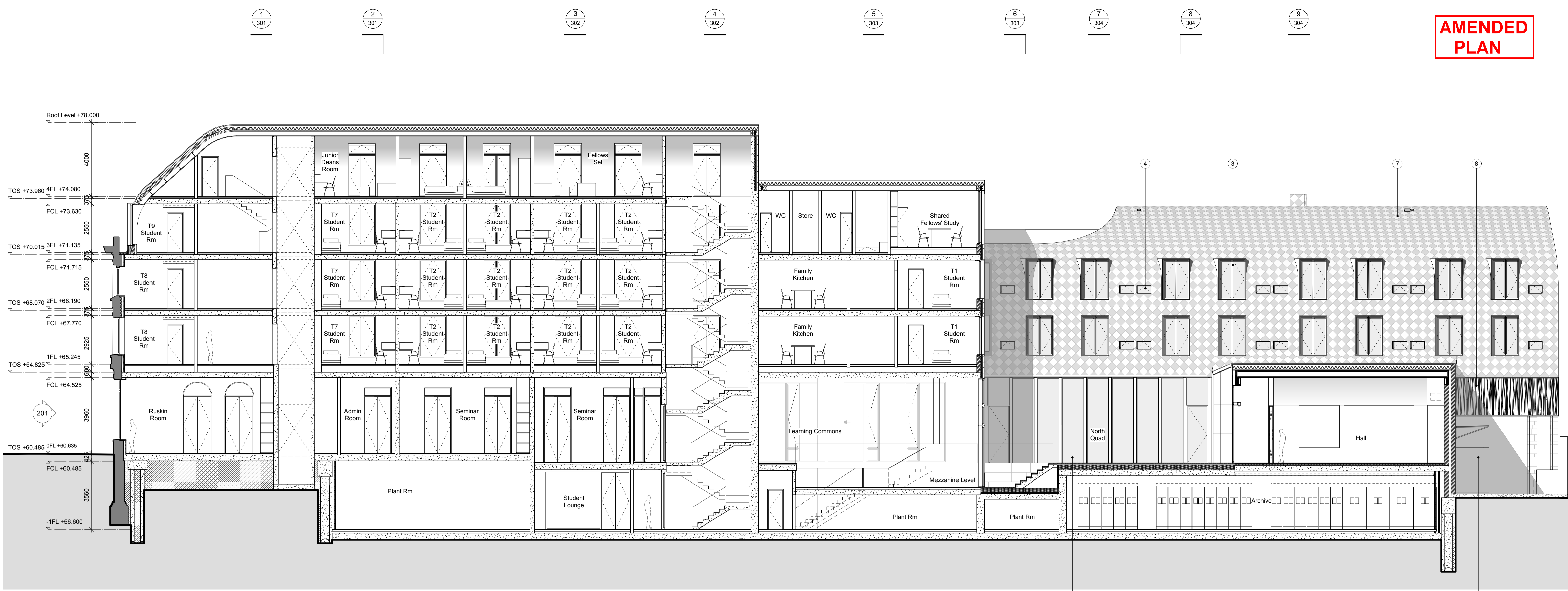
10 LONG SECTION 10