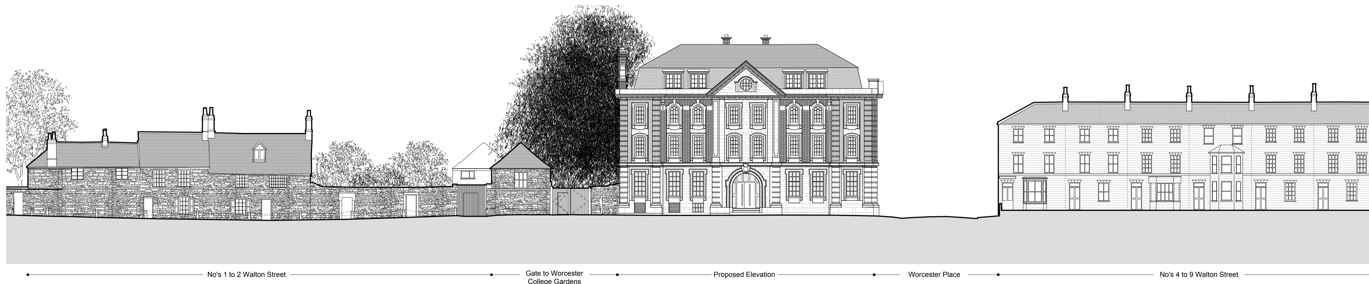
2 1:200 WALTON STREET ELEVATION