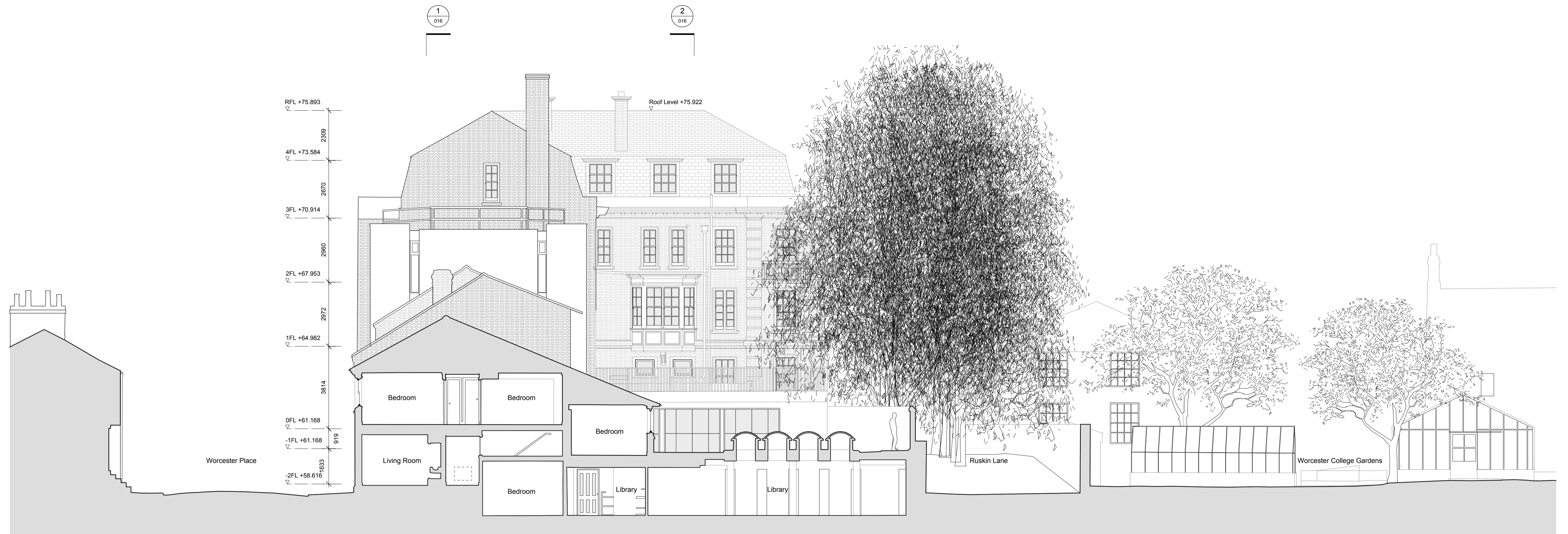
1 1:100 SECTION.AA