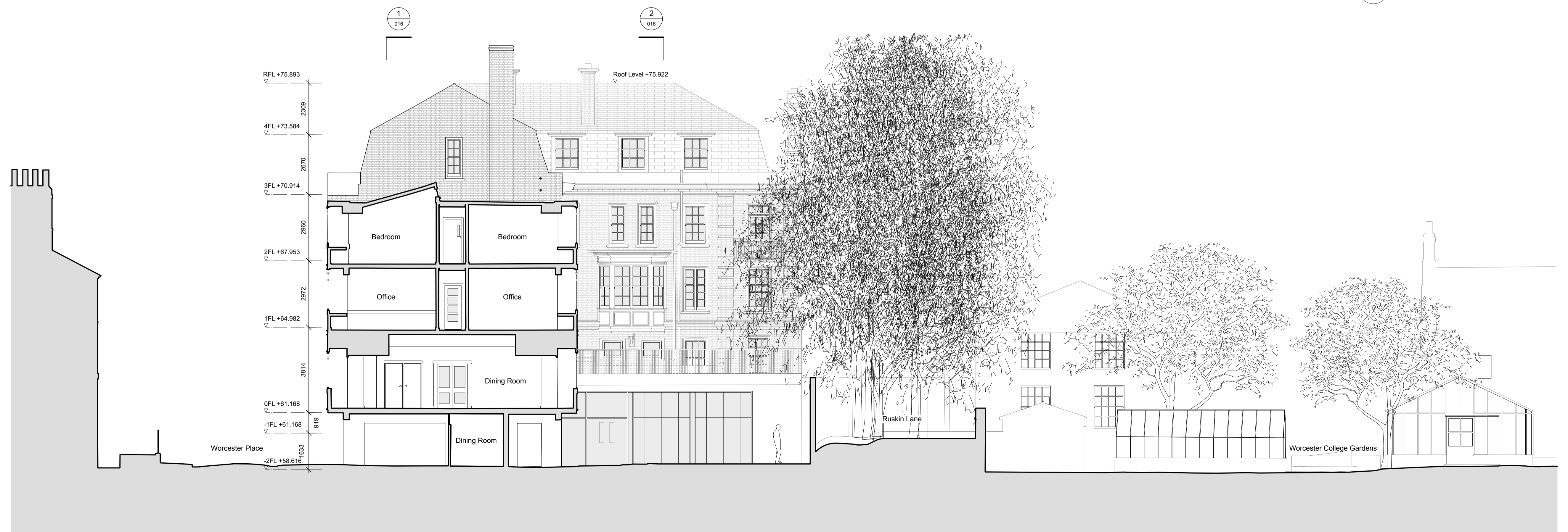
2 1:100 SECTION.BB