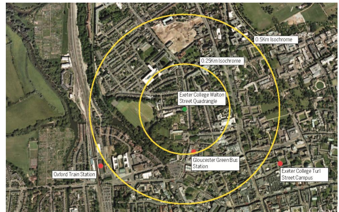
Figure 2 - 0.25km & 0.5km Isochrones

Students enrolled at this campus will all live within Oxford City Centre either on site or at other Exeter College sites or in private accommodation. See Figure 2 for isochrones for the city centre area. Ninety students will reside on site during term time with an additional 284 non residential students attending lectures here at various times throughout the day, based on available teaching rooms and staff the maximum non residential students on site at any given time will be 84. In addition to the 90 full time residential students there are 2 fellows and one junior dean also residing on the site.