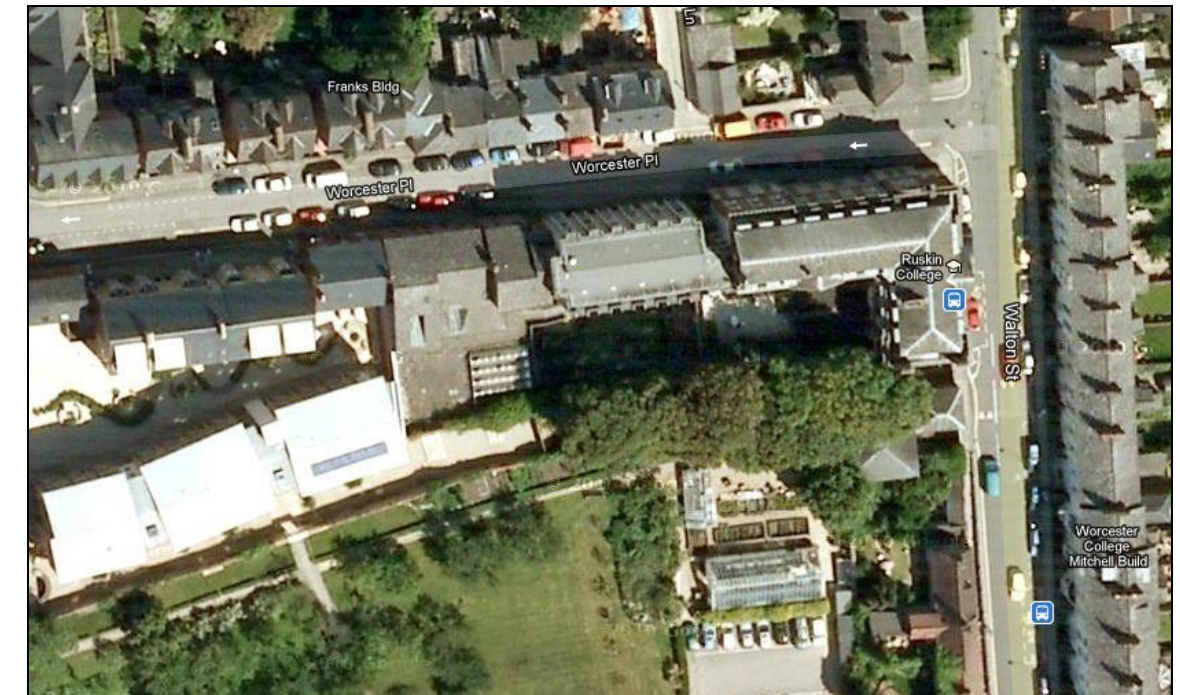
Figure 1 - Existing Site Plan

The site is located at the junction of Walton Street and Worcester Place in Oxford. The site sits on the northern edge of the city centre and is approximately 10 minutes walk from Oxford Train Station.