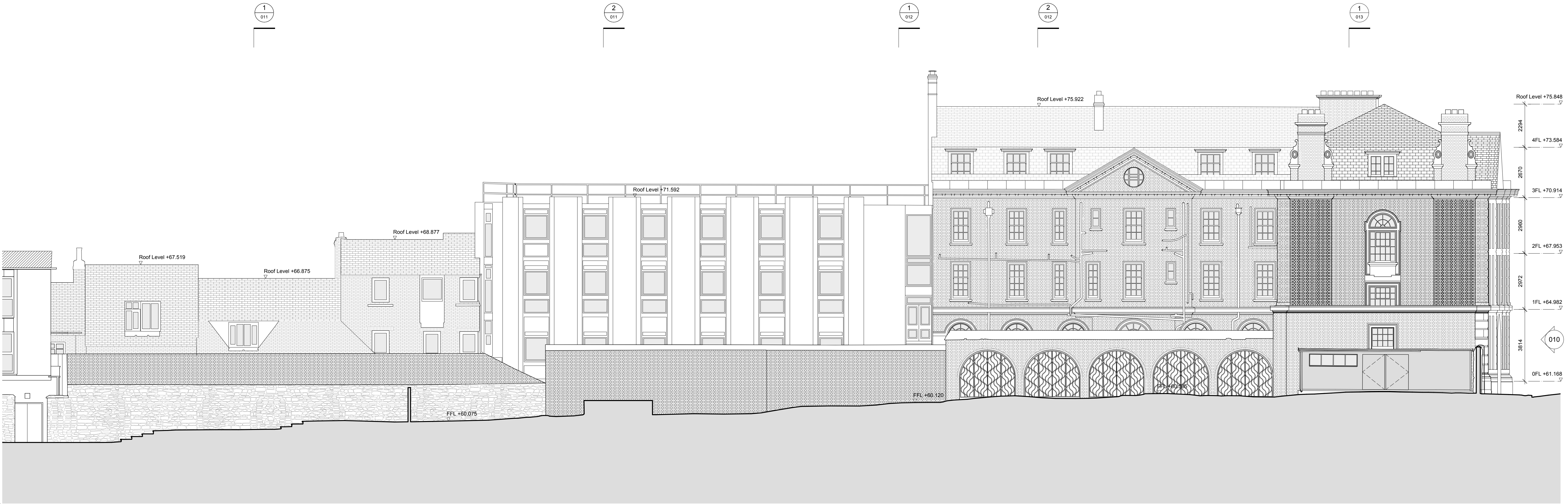
1 1:100 RUSKIN LANE ELEVATION