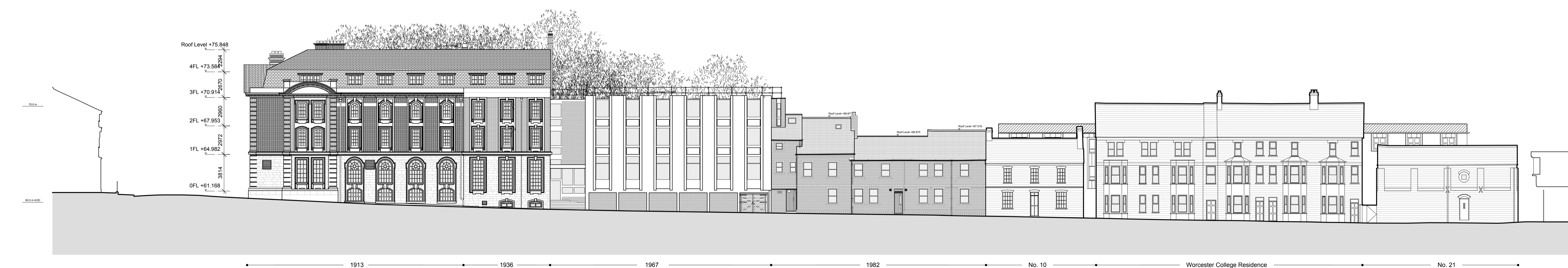
2 1:100 WORCESTER PLACE ELEVATION