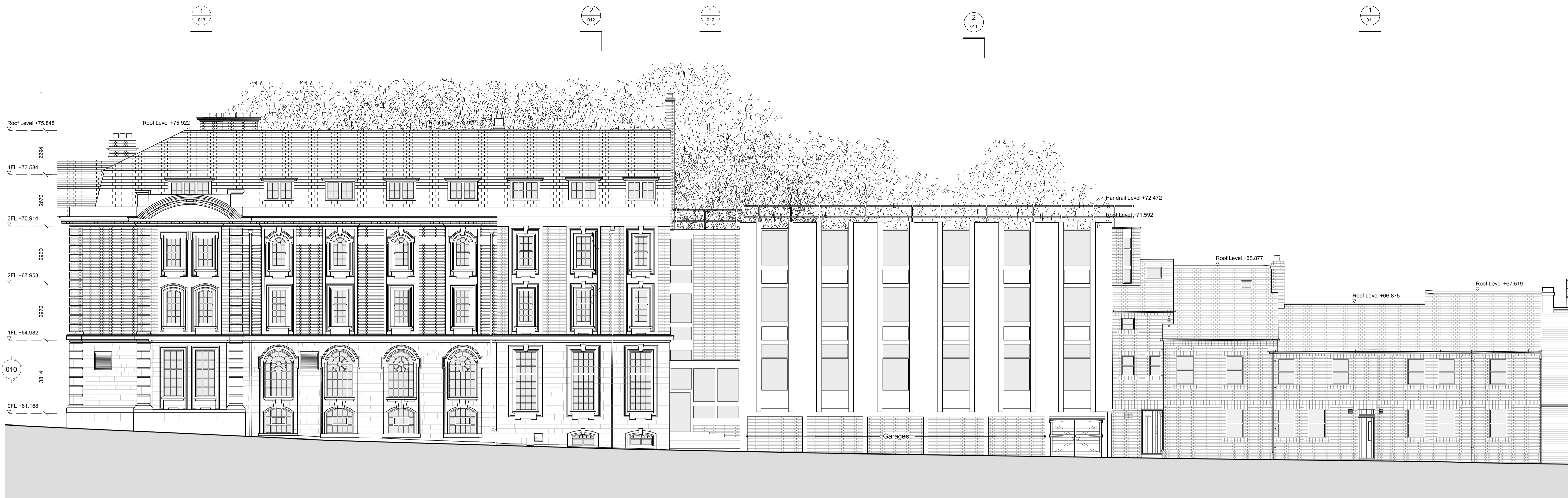
1 1:100 WORCESTER PLACE ELEVATION