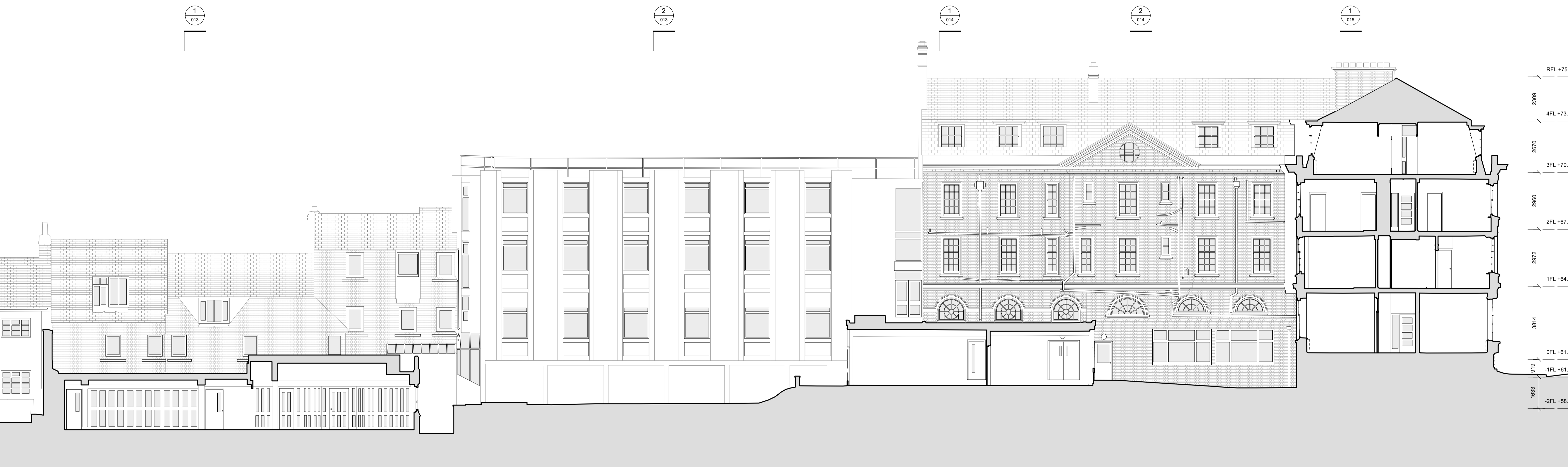
2 SECTION.GG 1:100