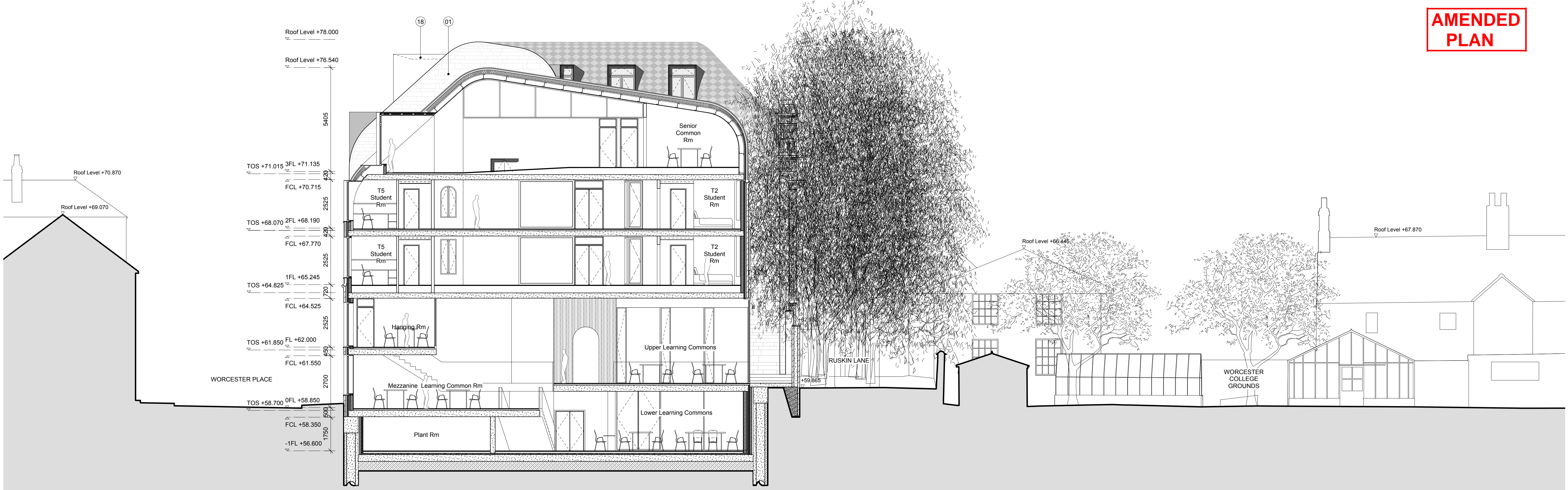
5 CROSS SECTION 5