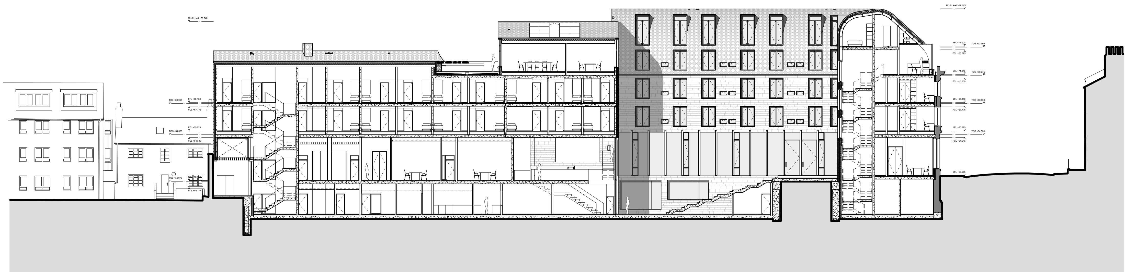
12 LONG SECTION 12