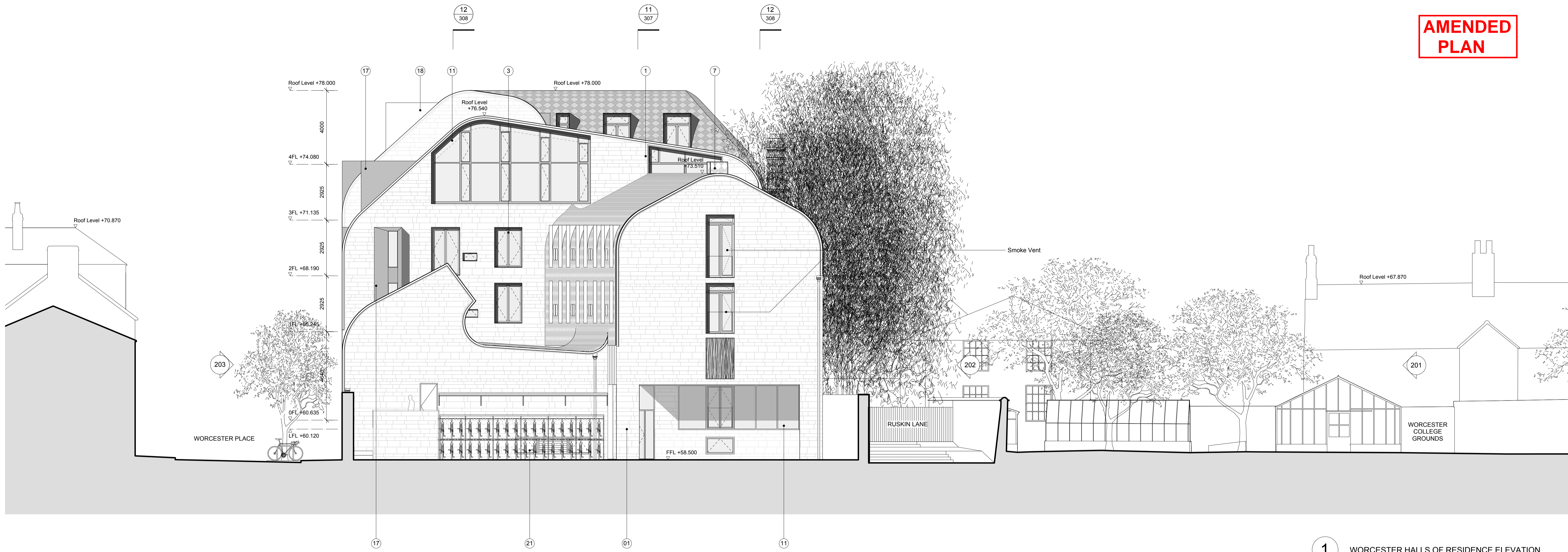
1 WORCESTER HALLS OF RESIDENCE ELEVATION