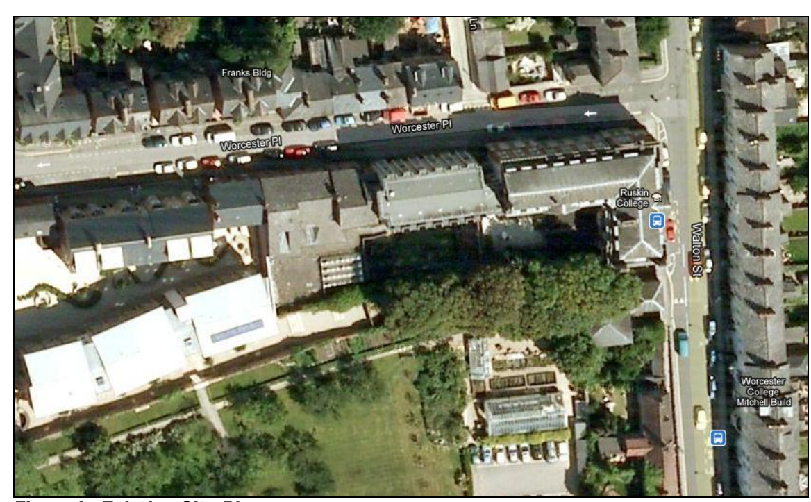
Figure 1 - Existing Site Plan

The site is located at the junction of Walton Street and Worcester Place in Oxford. The site sits on the northern edge of the city centre and is approximately 10 minutes walk from Oxford Train Station.