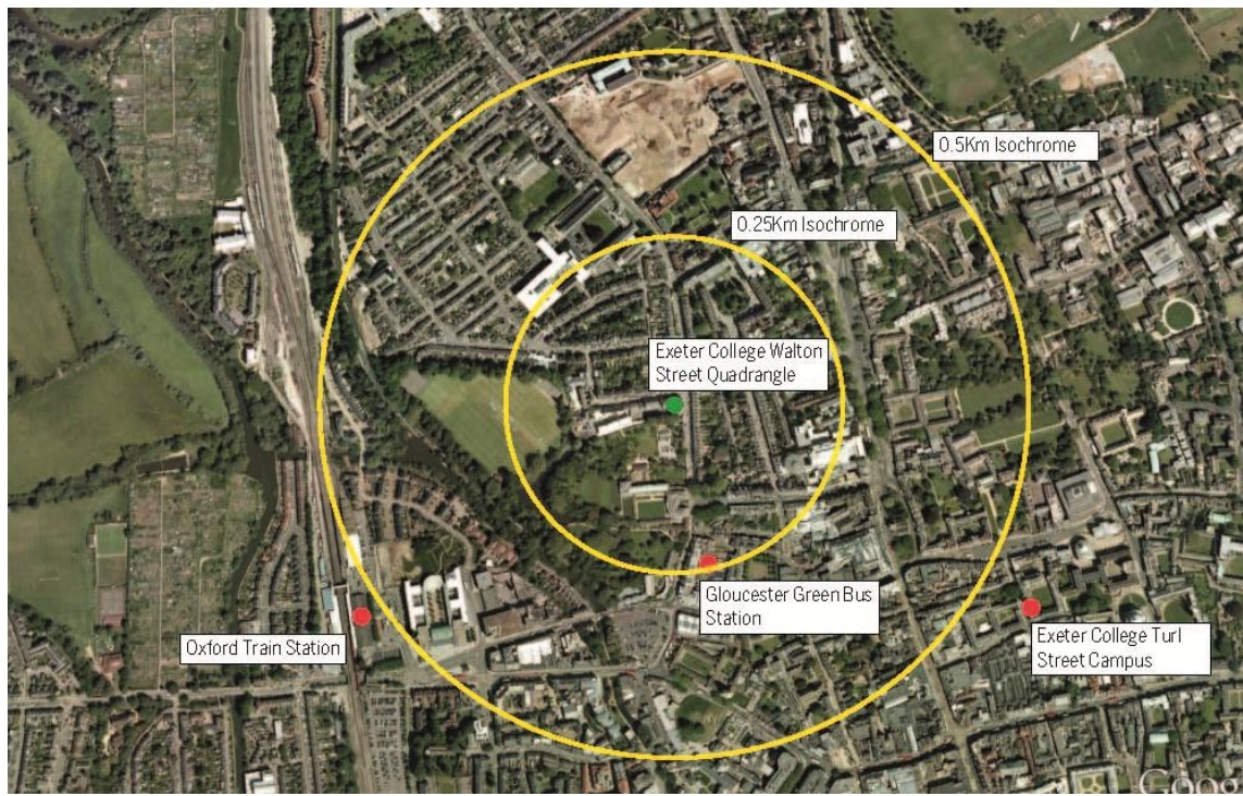
Figure 2 - 0.25km & 0.5km Isochrones

Students enrolled at this campus will all live within Oxford City Centre either on site or at other Exeter College sites or in private accommodation. See Figure 2 for isochrones for the city centre area. Ninety students will reside on site during term time with an additional 284 non residential students attending lectures here at various times throughout the day, based on available teaching rooms and staff the maximum non residential students on site at any given time will be 84. In additional to the 90 full time residential students there are 2 fellows and one junior dean also residing on the site.