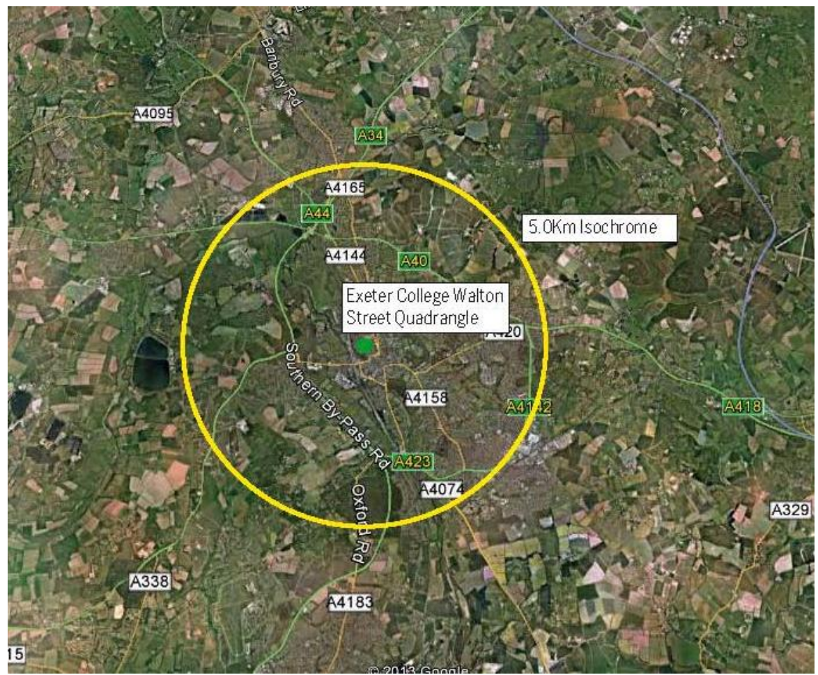
Figure 3 - 5km Isochrone

Good public transport links within walking distance from the new campus will form the sustainable means of travel for students or staff that reside outside of a distance that could reasonably be walked or cycled. Presently the College believe that all the staff and students will be living within 5-6km of the site, this assumption is based on evidence gathered from informal surveys carried out on students and staff over the past ten years on other Exeter College Campuses.